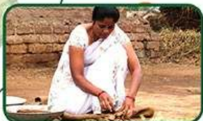
Traditionally Home Made Natural Products