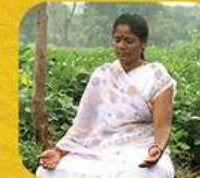
COSMIC LIGHT ENERGY

Healing treatment to support efficient growth